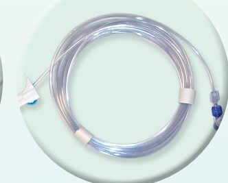
600cm of unbound warming coil tubing provides versatility for use with a variety of fluid warming systems (e.g., Spectratherm, Prismaflo<sup>®</sup>, Astrotherm<sup>®</sup>, etc.)

Bonded helical warming coil for convenient warming w/ heating device (e.g., K-pad, heat lamp, etc.)